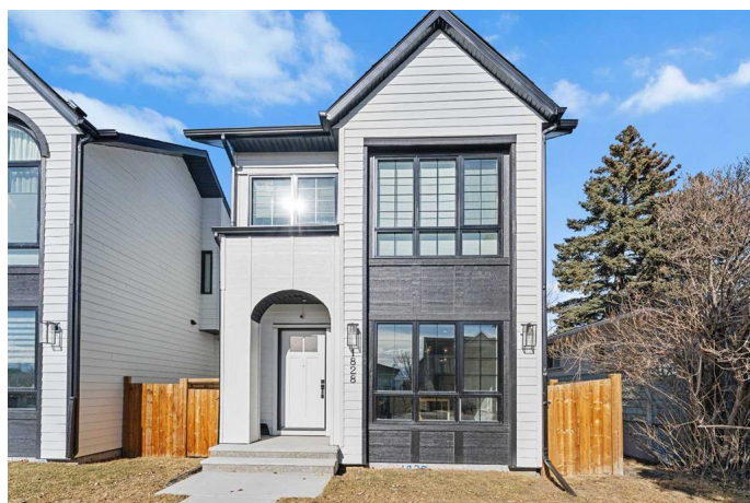
Client: Tri Nhan Le - EXP Realty Address: 1828 18 Ave NW, Calgary Level: Basement