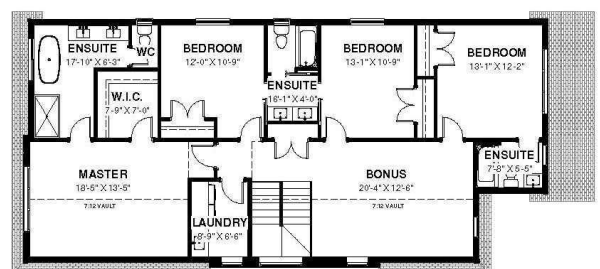
SECOND 1,546 SQ.FT.