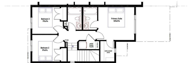
UNIT SQFT - UPPER 630sq ft